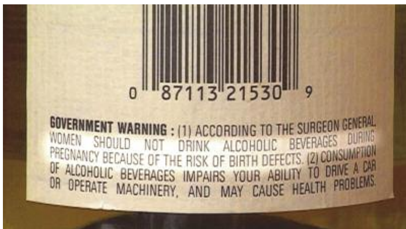
US Warning label

ted to evaluate whether the legislation was achieving its stated objectives 12 . Public support for warning labels was very high, with, after their introduction, some 9/10ths of the population agreeing that alcoholic beverages should have warning labels about possible health hazards.