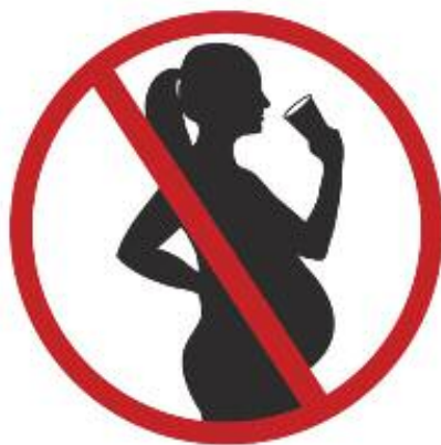
French motif Consumption of alcoholic beverages during pregnancy even in small amounts can seriously damage the child's health

tion, wine and spirits must indicate “contain sulphites”. Further requirements relating to ingredients listing may also be impending, following a recommendation that the feasibility of mandatory listing of ingredients on alcoholic beverages should be investigated. 5 At present, there is no obligation to mention any health warnings, although a number of countries, for example, Finland and France, are doing this, and the United Kingdom is planning this.